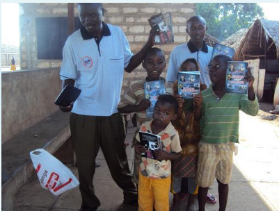
Distributing tracts and baby bags to mothers

We had different people from Kenya, who came to visit us, mostly from the Fiwagoh Mission. They helped teach in church, visit the people, and other things.