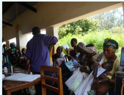
Distributing tracts in the city