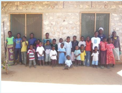
New clothes for the people

We also thank you, our friends, for your prayers and support. In our last report we wrote about the draught we had experienced here. We thank you for your help. Through your support some people have come to the truth and are faithful members in our church. Through their example many others have heard about the truth, too. We also thank all those, who donated clothes or gave the money to buy them. Now all our church members have something decent to wear to church. A special thank you goes to all those, who made the effort to visit us. You were a real blessing to the people here.