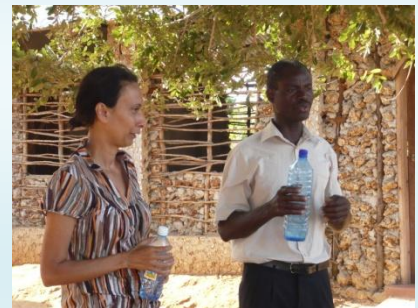
Giving a testimony