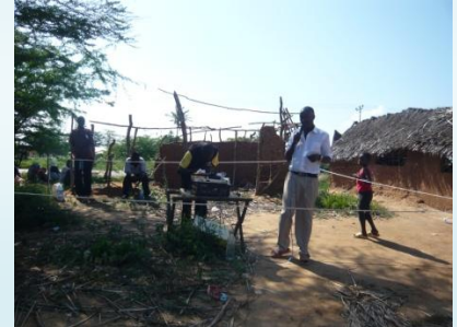
Open air preaching in a nearby village

We also had visitors from overseas. Primarily they came to see the work we are doing. There were some who helped give health lessons and treatments to our people here. If you want to come and help, you are most welcome.